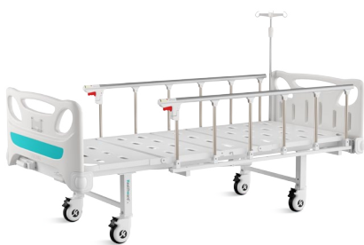
Safe working load

The infusion pole is made of stainless steel and has four plastic hooks that can bear up to 15 kg of weight.